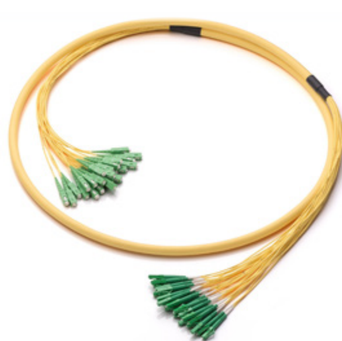
High Fanout Number (288f) & Small Fanout Length Tolerance (0.5cm)